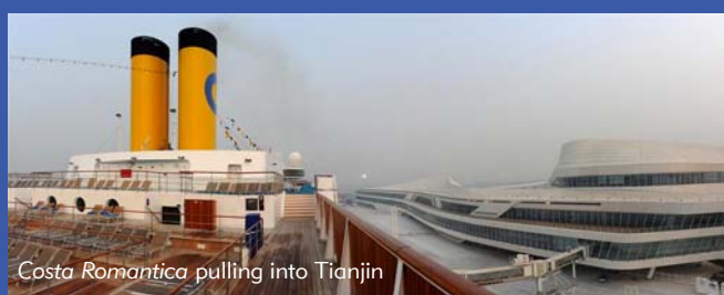
Costa Romantica pulling into Tianjin

Costa Romantica made history last week when she was the first-ever vessel to call into China's brand new cruise terminal in Tianjin.