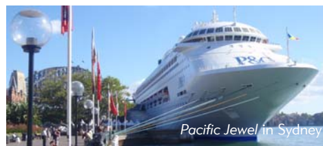
Pacific Jewel in Sydney

For more information and bookings contact a licensed travel agent, or P&O Cruises on 13 24 94 or visit www.pocruises.com.au .