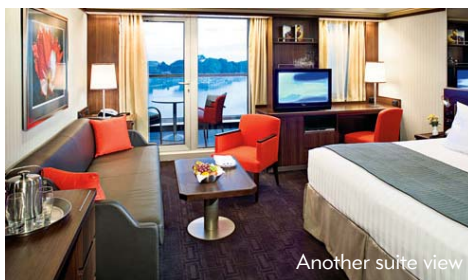
Another suite view

For more information on Nieuw Amsterdam see your local travel agent or visit www.traveltheworld.com.au .