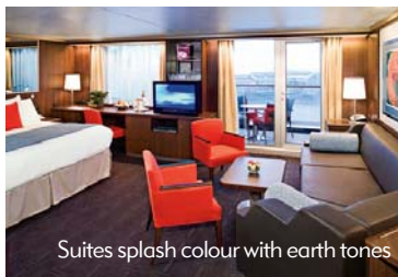
Suites splash colour with earth tones

As such, Nieuw Amsterdam's designers chose to blend both modern and classical