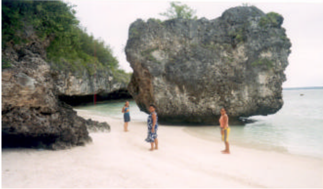
The girls go exploring and uncover some beautiful beaches and stunning coral formations!

Valley, Aramoana Hotel and lookout in Ivirua. Followed by a stop at the harbour, Te-Vai-O-Rongo water hole, marketplace, Mangaia Lodge, Mangaia College, and the old pineapple processing factory. Working up a good appetite for one of Babe's delicious homemade meals prepared by Mata. The next day sees the pair visiting the market for some Tiromi (pounded taro) and trying out