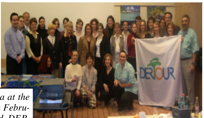
Right: Eager Travel Agents from the Frankfurt area at the conclusion of the Cook Islands Breakfast Seminar in February this year supported by Air New Zealand and DER-