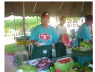
Mama's Café Stand