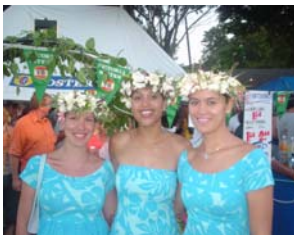
Tourism staff hard at work

Organised by the Cook Islands Tourism Corporation, the International Food Festival is a popular event providing both locals and visitors an opportunity to show off their culinary skills and explore a variety of taste sensations. It is an occasion to mix & mingle while enjoying the Cook Islands style festivity.