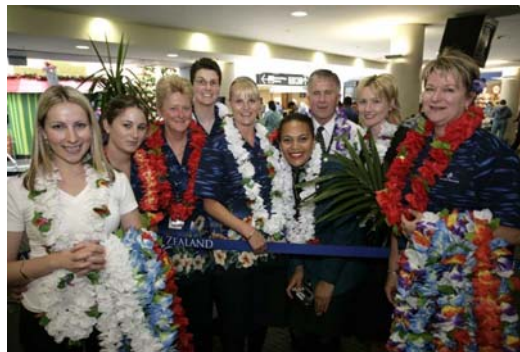
Air NZ staff flying Island Style