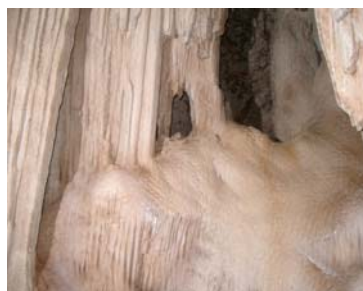
Magnificent rock formations at the entrance of a Cave.