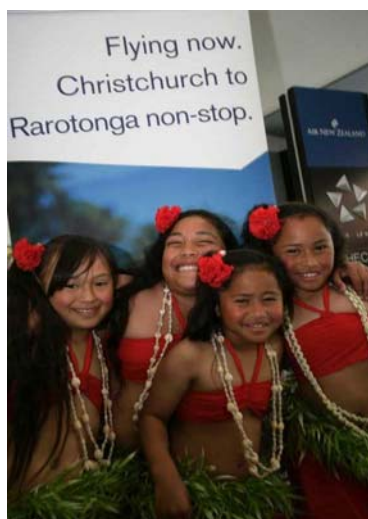
Members of the Welcome Party

The non stop service will operate a 146 seat Airbus A320 aircraft. Air NZ says this will provide good connection with Australian flights and allow Melbourne and Sydney travellers thru the South Island. Flight time Chc/Akl is 5 hours and return flight will take 5 and a half hours.